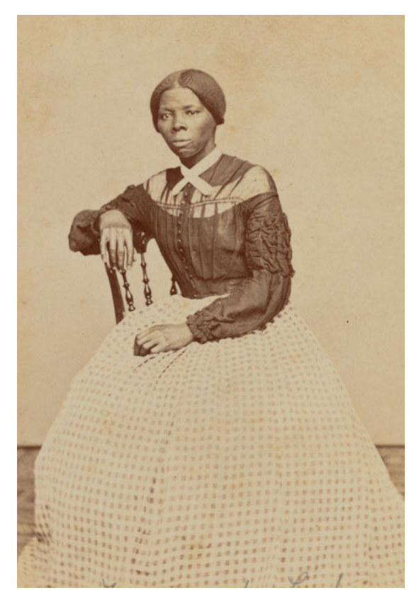
Harriet Tubman circa 1868.

As our story unfolds, we learn of Harriet's early years in slavery, her escape to freedom, and her time as a conductor on the Underground Railroad.