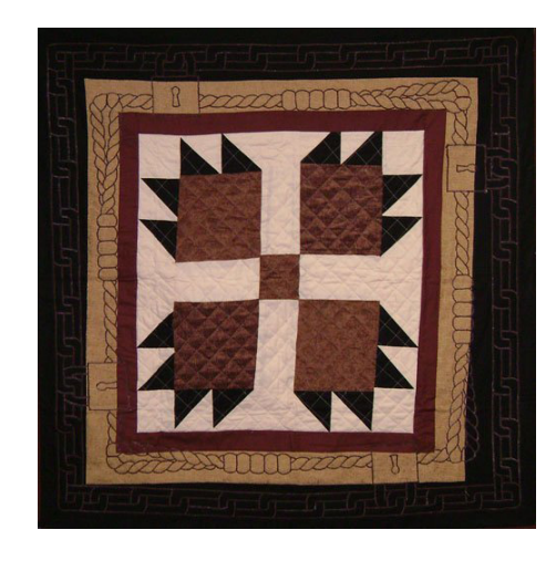
Bear Paw code instructed runaways to follow the bear tracks through the mountains, staying away from roads.