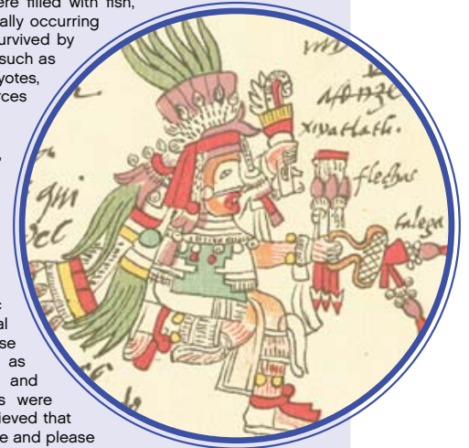
The god Camaxtli Mixcoatl or Camaxtli as depicted in the Codex Telleriano-Remensis.

Human sacrifices were important in the Aztec culture during important religious and social occasions. For instance, in order to please the main Aztec god Huitzilopochtli (known as "hummingbird wizard," god of war, sun god, and patron of Tenochtitlan), captives and slaves were sacrificed and then offered up. The Aztecs believed that these sacrifices would prolong human existence and please their gods. Sacrifices were crucial in keeping the gods happy.