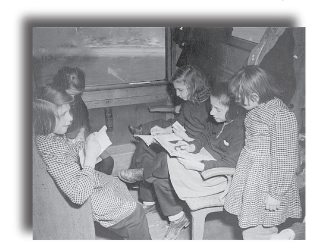
Children traveled without their parents on the Kindertransport.

www2.warnerbros.com/intothearmsofstrangers