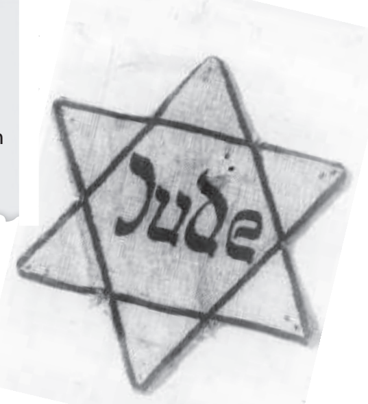
The Nazis forced Jews to wear yellow stars on their clothing.

In the late 1930s and early 1940s, the Nazis made it mandatory for all Jewish people to wear a yellow Star of David with the word "Jew" on the left chest of outer clothing. This visual labeling clearly distinguished Jews from non-Jews. The "Jewish Badge" made it easier for those in power to discriminate against and persecute Jews.