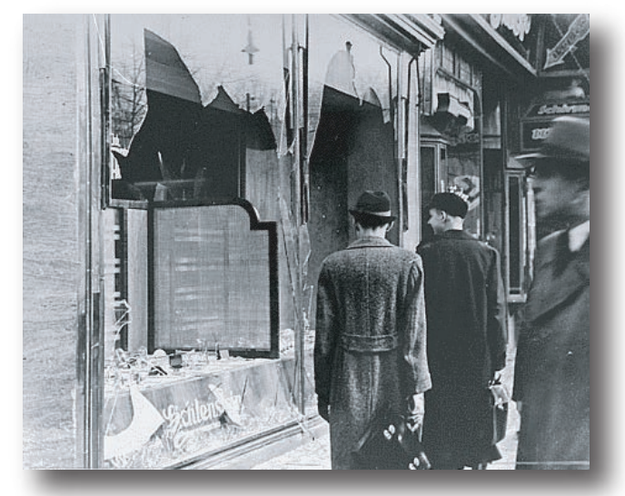
Passersby examine the damage done to a Jewish owned store by the Nazis during Kristallnacht .

In German, Kristall translates to "crystal," meaning broken glass, and Nacht means "night." Because of the huge amount of shattered store windowpanes that covered German streets, these violent attacks came to be called Kristallnacht—" Night of Broken Glass."