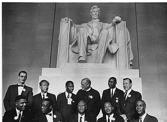
Leaders of the march posing in front of the statue of Abraham Lincoln, Lincoln Memorial, Washington DC, 08/28/1963.

During the August 28, 1963 March on Washington, Dr. Martin Luther King, Jr. delivered a speech on the steps of the Lincoln Memorial that became known as the “I Have a Dream” speech. Studying the text of the speech, a primary source document, provides us insight into the goals of the marchers, the emotions of that day, and into the social climate that precipitated Dr. King's ideas as expressed in the speech.