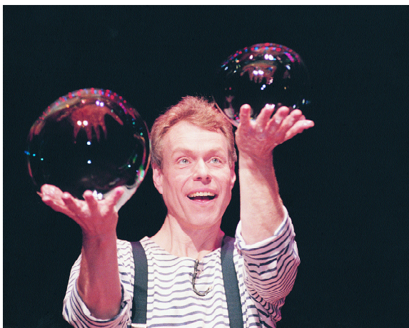
Trent The Mime juggles soapbubbles.